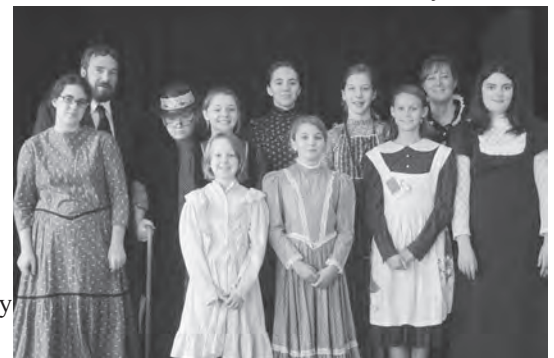
The cast of Christmas with Little Women .